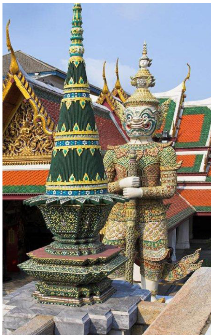
Emerald Palace, Bangkok, Thailand